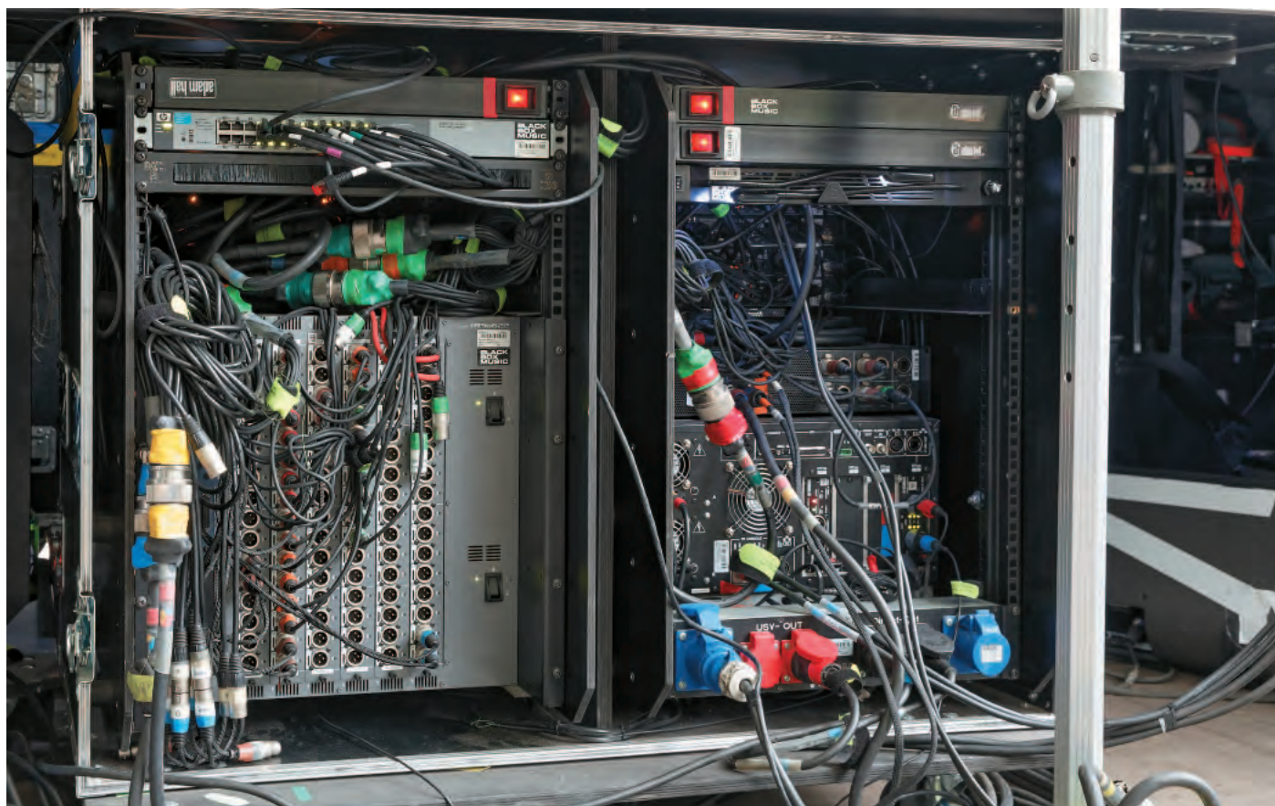
RPio622 I/O rack for the outputs under the monitor console