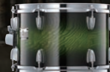
Textured Green Sunburst(TGS)