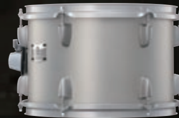
Matte Silver Metallic(MSM)