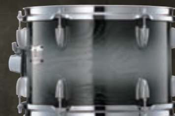
Textured Smoke Sunburst(TSS)