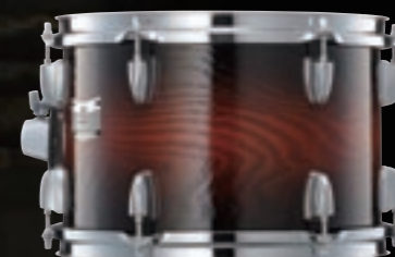
Textured Brown Sunburst(TWS)