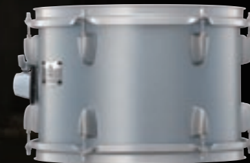
Matte Blue Metallic(MUM)