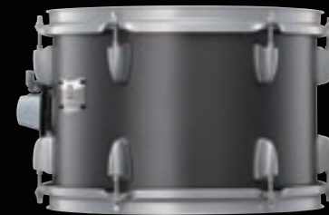
Matte Black Metallic(MBM)