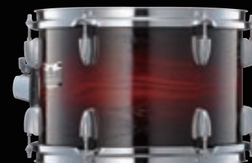
Textured Red Sunburst(TRS)