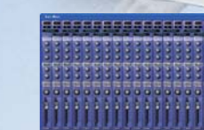
MO6/MO8 Multi Part Editor