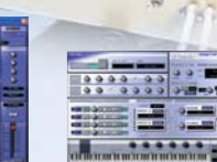
MO6/MO8 Voice Editor