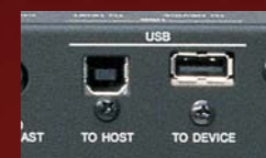
S90 XS/S70 XS Editor VST

And keep in mind that anything you've recorded to the memory stick, even audio files created on your computer, can be played back on the S90 XS/S70 XS—which means you can create your own custom audio backing tracks and perform along with them on the S90 XS/S70 XS. For example, you can create a basic song track beforehand, then sing and solo over it during your performance. Or add guitar parts and vocal harmonies to be played back with your live performance. There's also a useful Song Chain function that lets you string together separate recordings and create a convenient backing track “set list” for your gigs.