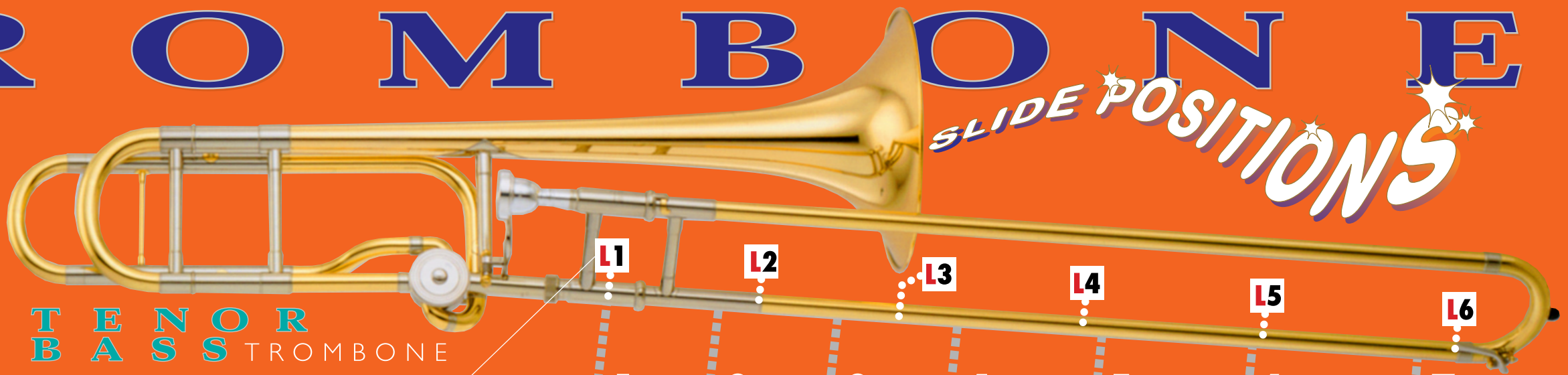
TENOR BASS TROMBONE